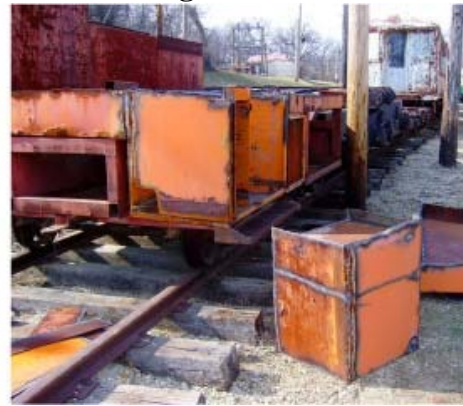
Left: Making progress is slow and time consuming. Right: Parts from the cart ready for the scrap pile.