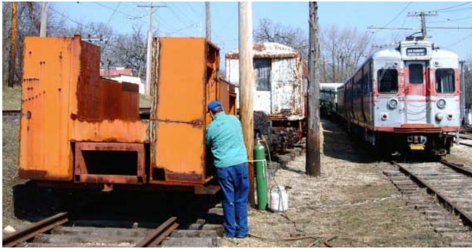
Fred Lonnes, the cutting "surgeon" disassembling the AAR cart.