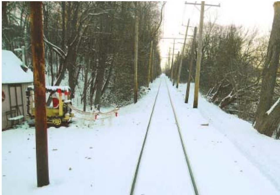
View from the head end of the "Polar Express" as it passes the Tredup's.